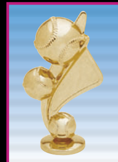
5064-G BASEBALL PENNANT FIGURE 6" (100-Q-9)