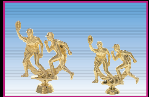
1447-G DBL. ACTION BASEBALL, M 4 3/4" (100-N-9)