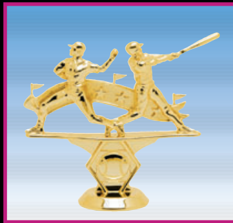
88503-G BALL PARK DBL ACT BASEBALL, M 5" (50-O-9)