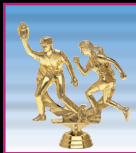
1452-G COED DBL. ACTION SOFTBALL 4 5/8" (100-N-9)