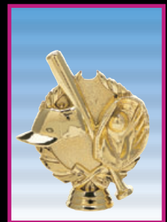
3026-G WREATH BASEBALL 4 3/4" (50-N-9)