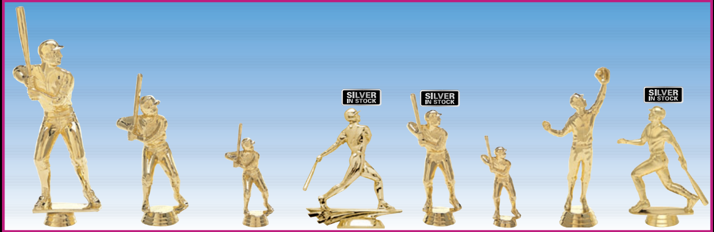
1530-G BATTER, M 8 3/4" (50-W-9)