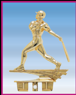
66503-G SPORT SNAP BASEBALL, M 5" (100-K-9)