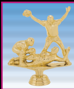
1477-G TRIPLE ACTION BASEBALL, M 5 3/4" (100-S-9)