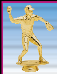
5063-G SOFTBALL FIELDER, M 5 3/4" (100-M-9)