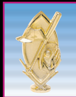
5114-G BASEBALL SPORTS FIGURE 5 3/4" (100-R-9)