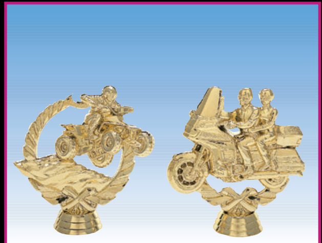
3023-G WREATH QUAD WHEELER 4 1/4" (50-O-9)