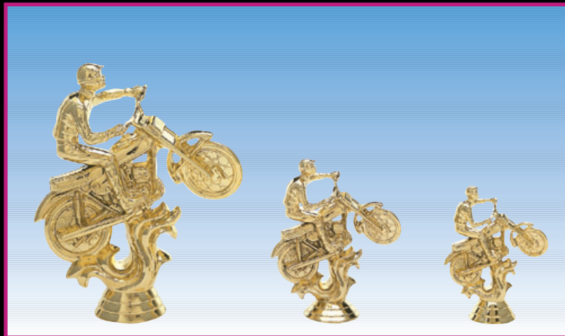
371-G MOTORCYCLE, M 6 3/8" (50-X-9)