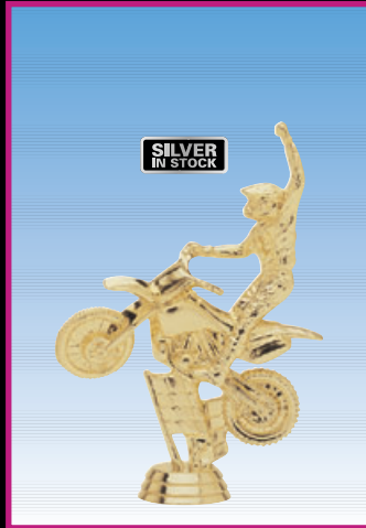
657-G OFF-ROAD MOTORCYCLE 5" (100-N-9)