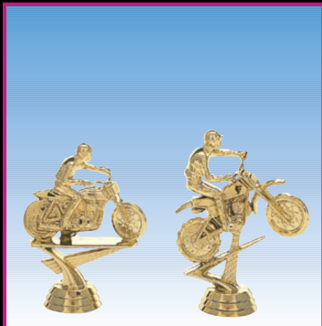
360-G MOTORCYCLE FLATTRACK 4" (100-M-9)