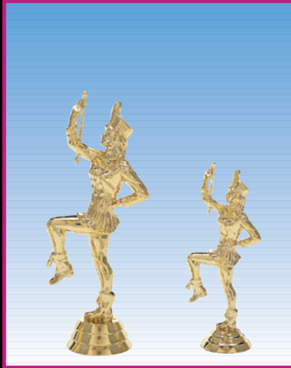
608-G MAJORETTE 6" (100-N-9)