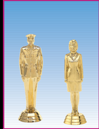
537-G MILITARY, M 5 1/2" (100-N-9)