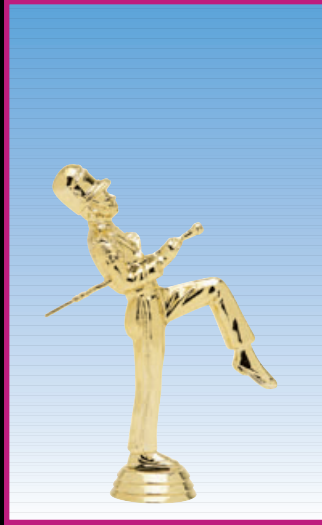
659-G DRUM MAJOR 5 3/8" (100-S-9)