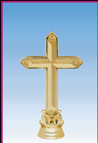
4044-G LARGE CROSS 5 5/8" (100-P-9)