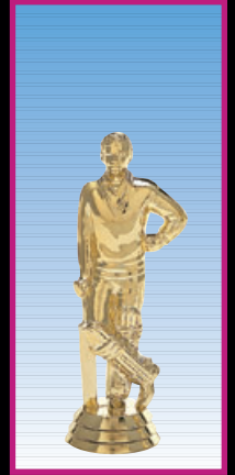
531-G CRICKETER, M 5" (100-M-9)