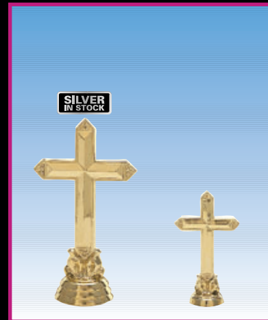
4005-G* CROSS 4 1/2" (100-K-9)