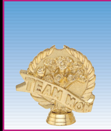
3045-G WREATH TEAM MOM FIGURE 3 7/8" (50-N-9)