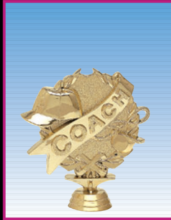
3040-G WREATH COACH 4 1/2" (50-N-9)