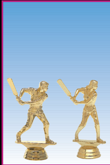
4012-G INDOOR CRICKET, M 4 1/2" (100-O-9)