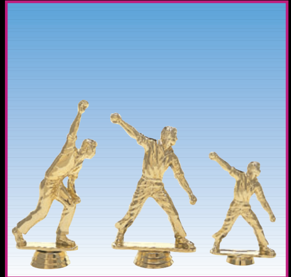
4004-G CRICKET BOWLER, M 5" (100-O-9)