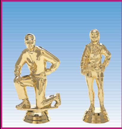
536-G COACH, M 5" (100-O-9)