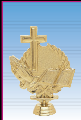
3039-G WREATH CROSS 5 1/4" (50-N-9)